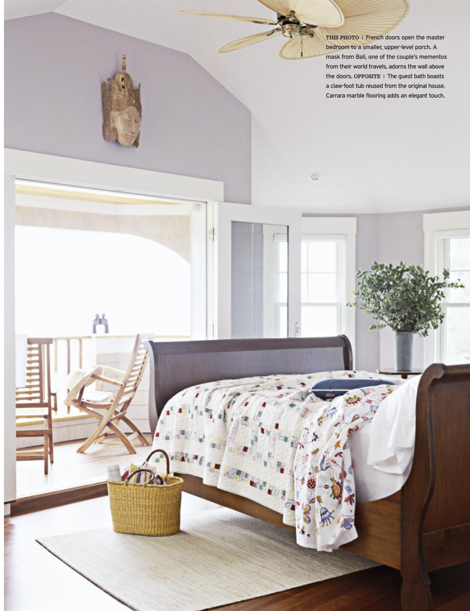
THIS PHOTO | French doors open the master bedroom to a smaller, upper-level porch. A mask from Bali, one of the couple's mementos from their world travels, adorns the wall above the doors. OPPOSITE | The guest bath boasts a claw-foot tub reused from the original house. Carrara marble flooring adds an elegant touch.